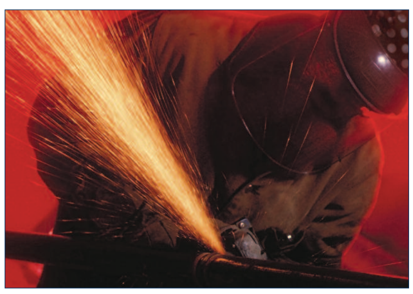
Tool maintenance and safe operating conditions can be monitored using HVM100

Model HVM100 provides a portable, convenient way to collect and analyze data in accordance with the most current ISO requirements for assessing hand-arm and whole-body vibration exposure. Measuring three input channels simultaneously, the HVM100 provides the signal filtering, integration, and data storage necessary to comply with ISO Standards 2631, 5349, and 8041. A fourth channel calculates and stores vector sum information. Single axis and triaxial accelerometers with specialized mechanical mounting adaptors and various software packages are available to complete the system.